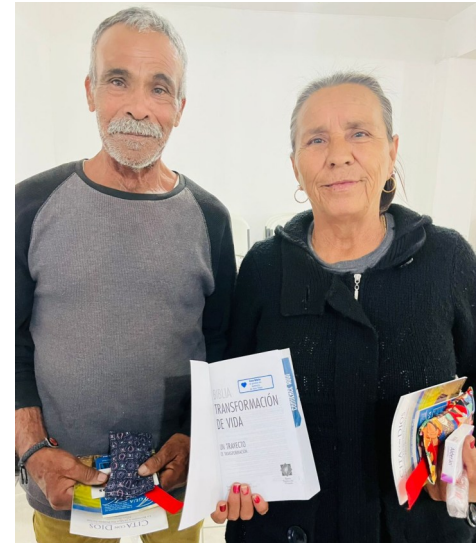
This couple both became new believers and received new Bibles.