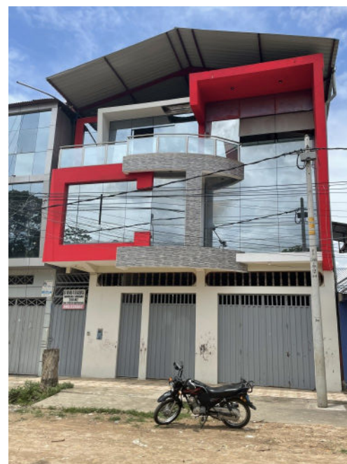
We are praying the Lord might provide this building for the Women's clinic

For now we ask you to pray that all of the groundwork can be properly and quickly accomplished and we can move ahead with finding a building and getting the new clinic operational.